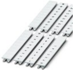
Zack marker strip, 10-section, vertically labeled with the consecutive numbers: 11 ... 20, white, width: 5 mm

Please be informed that the data shown in this PDF Document is generated from our Online Catalog. Please find the complete data in the user's documentation. Our General Terms of Use for Downloads are valid ( http://phoenixcontact.com/download )